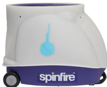
Hopper upside down for portability/storage

You can attach the hopper either upright for play mode, or upside down for portability/storage (note you can remove the carousel too if you need to). To attach the hopper, simply align it correctly and then push down on it until it locks into place.